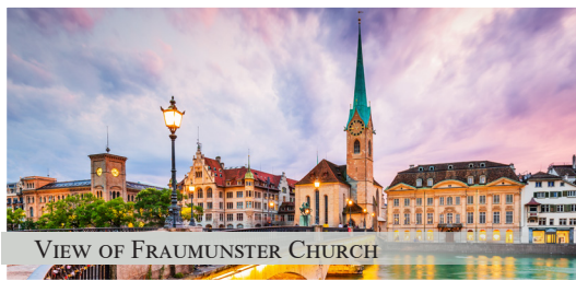
VIEW OF FRAUMUNSTER CHURCH

TUESDAY, AUGUST 13 TH - Our excursion today takes us through archetypical beautiful Swiss countryside of mountains, valleys and lakes. Our first stop pays homage to William Tell at the Hohle Gasse to see the commemorative chapel that marks the place where Tell lay in wait for the evil bailiff Gessler, to get his revenge. From here, we return to the shores of the Vierwaldstättersee (also known as Lake Lucerne) at Kusunacht and follow the lakeshore south to the picturesque town of Weggis. We'll stop to explore this beautiful lake side resort town and have lunch. A short boat ride on the lake brings us to the charming town of Vitznau, where we meet our bus and return to our hotel in Lucerne for an evening at the Stadtkeller, a Lucerne institution, where you can enjoy traditional Swiss food and entertainment. (B, D) OVERNIGHT: LUCERNE