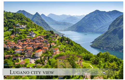
LUGANO CITY VIEW

MONDAY, AUGUST 12 TH - This morning a walking tour of the old town takes us across the famous covered bridge, the Kapellbrücke, past the Old Town Hall (Altes Rathaus) and through the unspoiled pedestrian areas of Kornmarkt and Weinmarkt to see the remains of the old city walls. There will be free time to shop, explore and have lunch before we gather again for an afternoon excursion up nearby Mt. Pilatus. We ascend by cable car and come back down by the steepest cog railway in the world! Should the weather take away the views, you can always spend the afternoon in Bucherer's, Switzerland's largest clock and watch outlet, but remember, it will always be sunny on top of the mountain above the clouds. The evening is free to explore Lucerne nightlife. (B) OVERNIGHT: LUCERNE