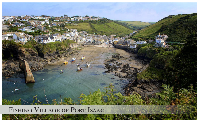
FISHING VILLAGE OF PORT ISAAC

Wales & the Welsh Borders, September 4 - 13, 2024