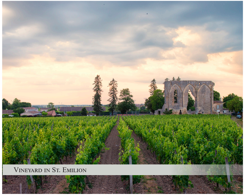
VINEYARD IN ST. EMILION

Bordeaux; the name itself conjures up a myriad of complex wine expectations. As France's largest wine producing region, and home to famous appellations, the region of Bordeaux has much to offer both the wine connoisseur and the novice alike. The city of Bordeaux, once nicknamed La Belle Endormie (the Sleeping Beauty) used to be plagued with industrial soot and despair, leaving wine lovers wanting to sample the local produce from far away! But like the grapes in the bottles, age has worked in her favor. Over the past decades, the city of Bordeaux has reinvented herself, now mirroring the beauty of the sprawling vineyards that surround her.