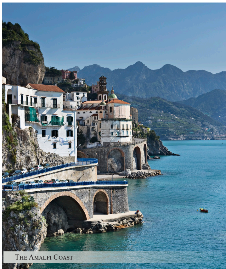
THE AMALFI COAST

Your Discover Europe tour guide will lead you through scenic landscapes, ancient towns, and sculpture filled gardens on this discovery of southern Italy. Join us on Sorrento & the Amalfi Coast .