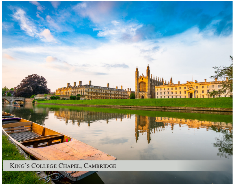
KING'S COLLEGE CHAPEL, CAMBRIDGE