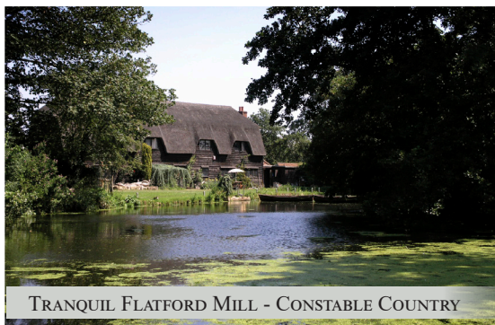
TRANQUIL FLATFORD MILL - CONSTABLE COUNTRY