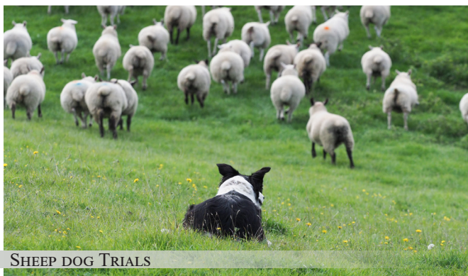
SHEEP DOG TRIALS

WEDNESDAY, AUGUST 9 TH - Off over the moors - so photogenic - past country homes and traditional stone farm cottages to Masham where we visit the famous Black Sheep brewery and learn its history, as well as sample the goods. Today we will also watch another iconic Yorkshire event: sheep dog trials - these must be seen to be believed. We continue to Askrigg and checking into The Skeldale House - now a wonderful B&B. (B, D) OVERNIGHT: ASKRIGG