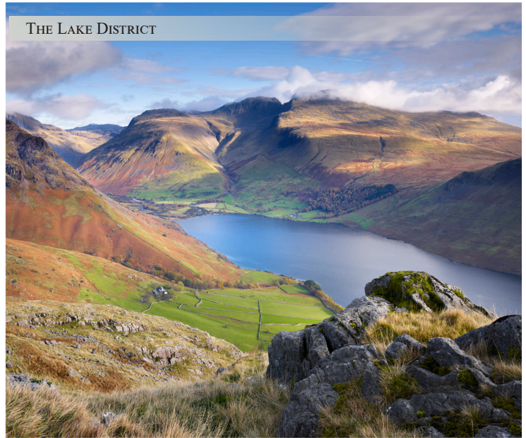
THE LAKE DISTRICT

Read on, get the details because there is so much more!