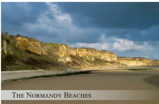
THE NORMANDY BEACHES

We'll explore the beaches at Normandy, with time also to view the extraordinary tapestry at Bayeux. Then it's off to Paris, the City of Light, and the heady excitement of one of the world's great romantic cities—with a local guide to introduce the splendors of Notre-Dame, Sacré-Coeur, and the Louvre, and free time to follow your own interests. It's a visit that spans a spectrum of experiences—from the drama of medieval villages, to the broad vistas of seaside towns, to the cosmopolitan beauty of city life, with all of their attendant architectural, artistic, and gastronomic masterpieces—truly a feast for the senses!