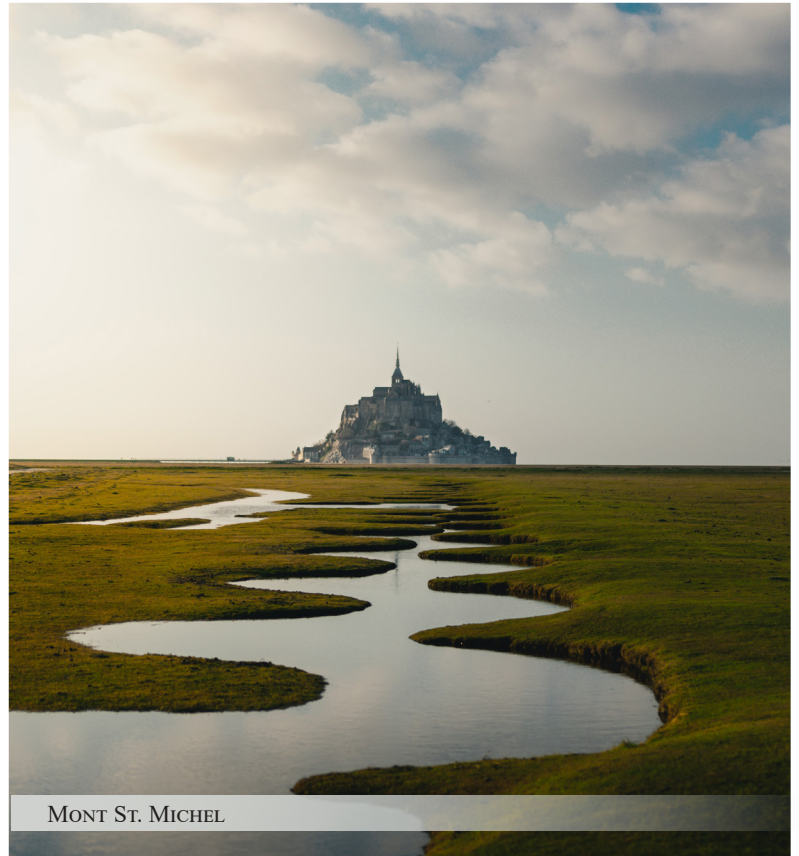
MONT ST. MICHEL

THE COST OF THIS ITINERARY, PER PERSON, DOUBLE OCCUPANCY IS: