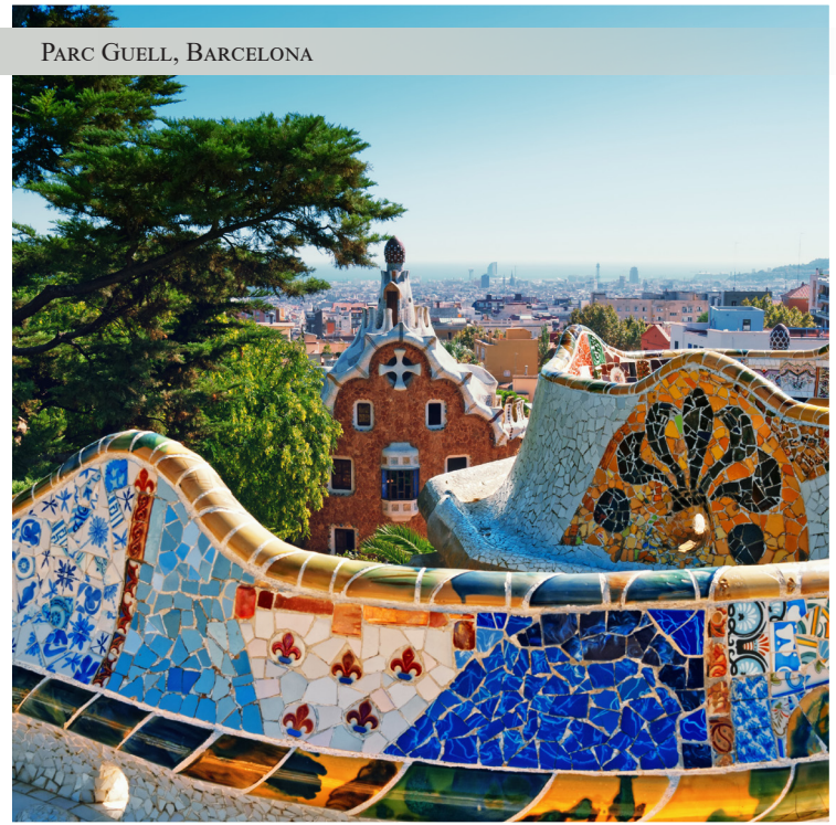
PARC GUELL, BARCELONA