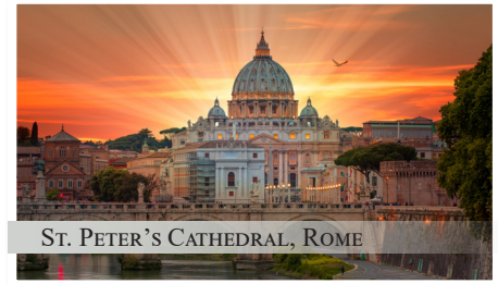
ST. PETER'S CATHEDRAL, ROME

SUNDAY, MARCH 30 TH - Classical Rome unfolds this morning as a local guide takes you on a walking tour that includes the Forum and the Coliseum. The afternoon is completely free to pursue your own individual interests. You may want to walk up the Spanish Steps to the church of the Santissima Trinita dei Monti and on into the Pincio, a beautiful park laid out in 1908-14. Here you can visit the Villa Medici, which houses the French Academy of Art, the Villa Borghese and the Galleria Borghese. Alternatively you may prefer to spend the day shopping along the Via Veneto, stopping every once in a while to sip cappuccino and watch the Romans at work and play. (B) OVERNIGHT: ROME