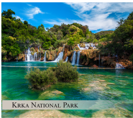
KRKA NATIONAL PARK

SUNDAY, NOVEMBER 10 TH - A morning excursion to Krka National Park, situated along the Krka River. Known for its series of 7 waterfalls—to the south, Skradinski Buk waterfall is flanked by traditional watermills, and to the north, a nature trail passes another striking cascade, Roški Slap, and the Krka Monastery, built above ancient Roman catacombs. Continuing on, we'll stop in Trogir—a small island connected to the mainland and the island of Čiovo by bridges—for lunch and exploration of its preserved old town, known for its mix of Renaissance, baroque and Romanesque buildings. We return to Split for a free evening. (B) OVERNIGHT: SPLIT