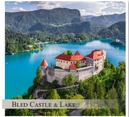
BLLED CASTLE & LAKE

SATURDAY, NOVEMBER 9 TH - Leaving Opatija, we continue our journey south, stopping along the way at Plitvice Lakes National Park, Croatia's largest national park covering almost 30,000 hectare. Interconnected by many waterfalls and watercourses above and below ground, the lakes are grouped into the upper and lower lakes. The former are formed on dolomites, with mild relief, not so steep shores and enclosed by thick forests, whereas the latter, smaller and shallower, are situated in limestone canyon with partially steep shores. There will plenty of time for exploring the park, along with lunch at a nearby restaurant before we make our way to our hotel in Split where dinner awaits us. (B, L, D) OVERNIGHT: SPLIT