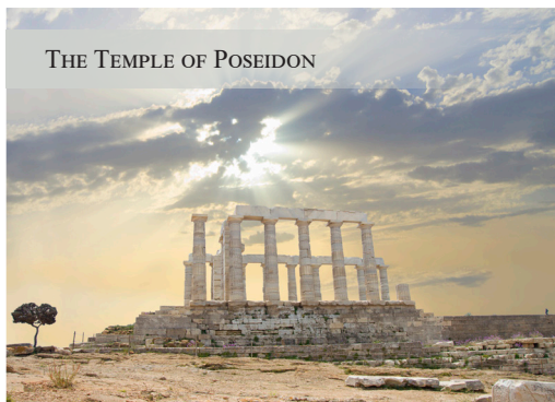
THE TEMPLE OF POSEIDON

SATURDAY, OCTOBER 28 TH - This morning we descend from the mountains, past Thebes of ancient legends, passing the place where Oedipus is supposed to have killed his father, and arrive at our hotel in Athens. After checking in, we will have a guided tour of the National Museum, with its treasures from Mycenae and other important sites throughout the Hellenic world. The evening is free to find a taverna for dinner. (B) OVERNIGHT: ATHENS