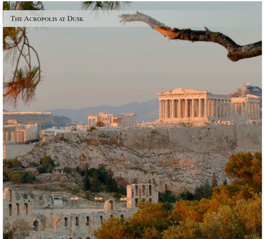
THE ACROPOLIS AT DUSK

Greece offers an unparalleled experience. The sun shines, the sea is warm, the food is delicious and varied, the people are friendly, and it has thousands of years of fascinating history, but don't take our word for it, come and discover it for yourself!